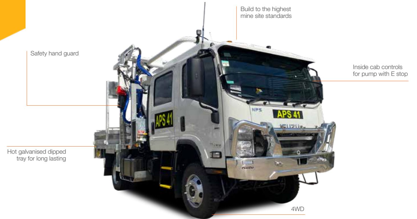
Built to the highest mine site standards

Built to the highest mining standards, the Dewatering Truck enables customers to pump water from blast holes quickly and efficiently, providing the opportunity to select more cost-effective blasting products while achieving the same results. The hydraulic pump is able to be controlled from inside the cab allowing the operator to remain in the vehicle's air-conditioned comfort while operating the unit. Simply drive to each hole that needs de-watering and effortlessly pump the water out, making the de-watering process more efficient and convenient.