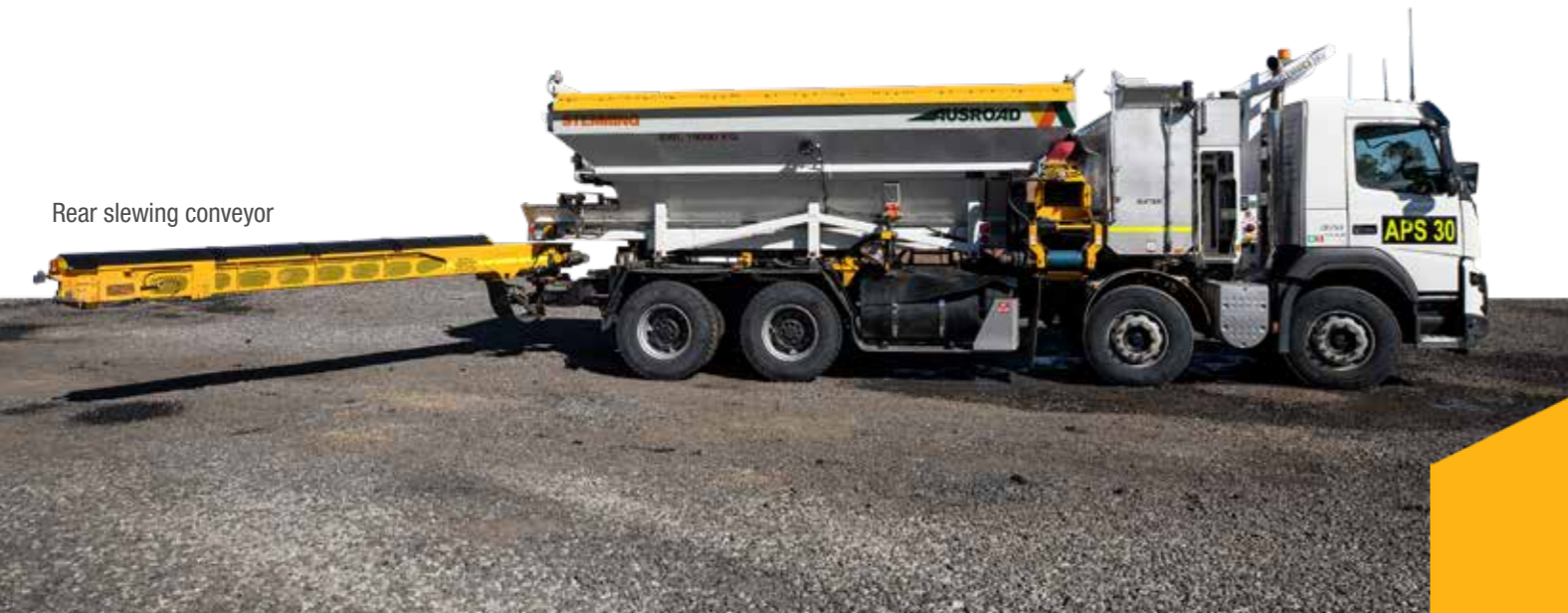
Rear slewing conveyor