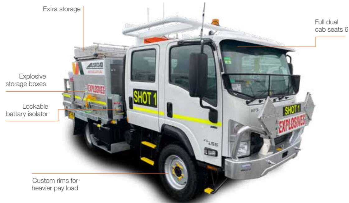
Custom rims for heavier pay load

Safety and efficiency were key factors in the design: A series of custom designed cargo nets prevent loads moving around when driving, and extra storage facilitates larger explosive cargoes. The utes are also engineered to carry heavier loads, reducing the need for multiple trips back and forth to explosive magazines.