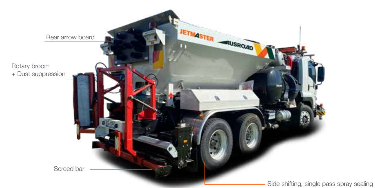
8 Spray jets for 2.4m width coverage