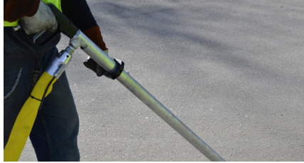
Electric Heated Wand Option