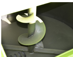
Performance Tank Design

The reputation of the MAGMA for simple, safe and sustainable operation lives on with the M-Series which marks a new chapter for Cimline™ with signature safety green paint.