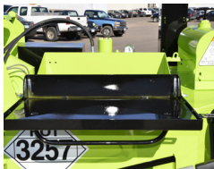
Lowest Height Largest Door