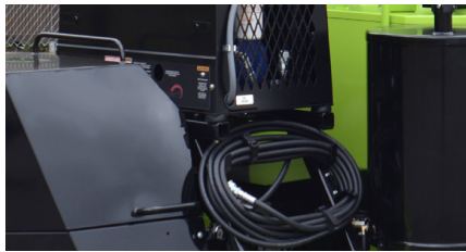
Optional Rotary Screw Air Compressor