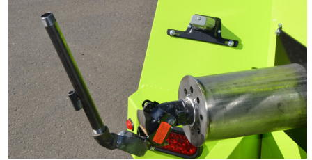
Optional Heated Draw-Off Option