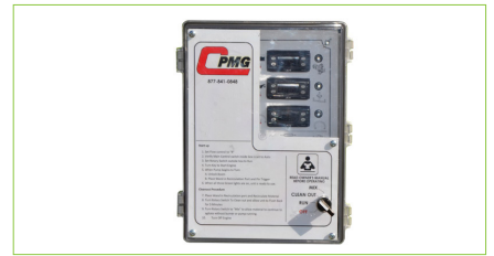
Simple Seal Controller