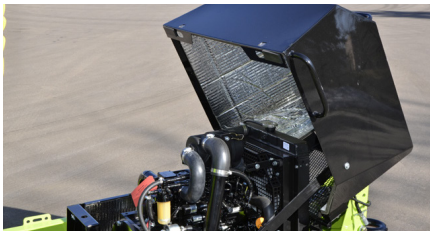
Optional Engine Cover